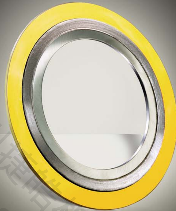
THERMICULITE® 835 Spiral Wound Filler