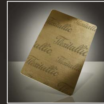
THERMICULITE® 815 Tanged Sheet

High temperature sheet reinforced with a 0.004" 316 stainless steel tanged core. Available in thicknesses of 1/32", 1/16", and 1/8" in meter by meter (standard) and 60" x 60" sheet. Cut gaskets also available in all shapes and sizes.