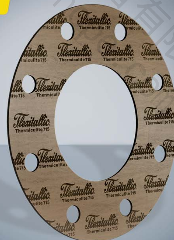
THERMICULITE® 715 Cut Gasket