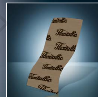
THERMICULITE® 715 Coreless Sheet

High-performance coreless sheet material. Replacement of compressed fiber sheet line, SF 2401, 2420, 3300, 5000 and tanged graphite sheet. Available in thicknesses of 1/32", 1/16", and 1/8" in cut gaskets and 60" x 60" sheet.