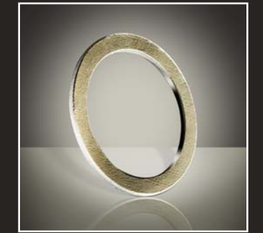
THERMICULITE® 845 Flexpro™ (kammprofile) Facing

High temperature filler material for spiral wound gaskets. Wide range of metals available.