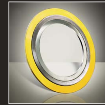
THERMICULITE® 835 Spiral Wound Filler

High temperature sheet reinforced with a 0.004" 316 stainless steel tanged core. Available in thicknesses of 1/32", 1/16", and 1/8" in meter by meter (standard) and 60" x 60" sheet. Cut gaskets also available in all shapes and sizes.